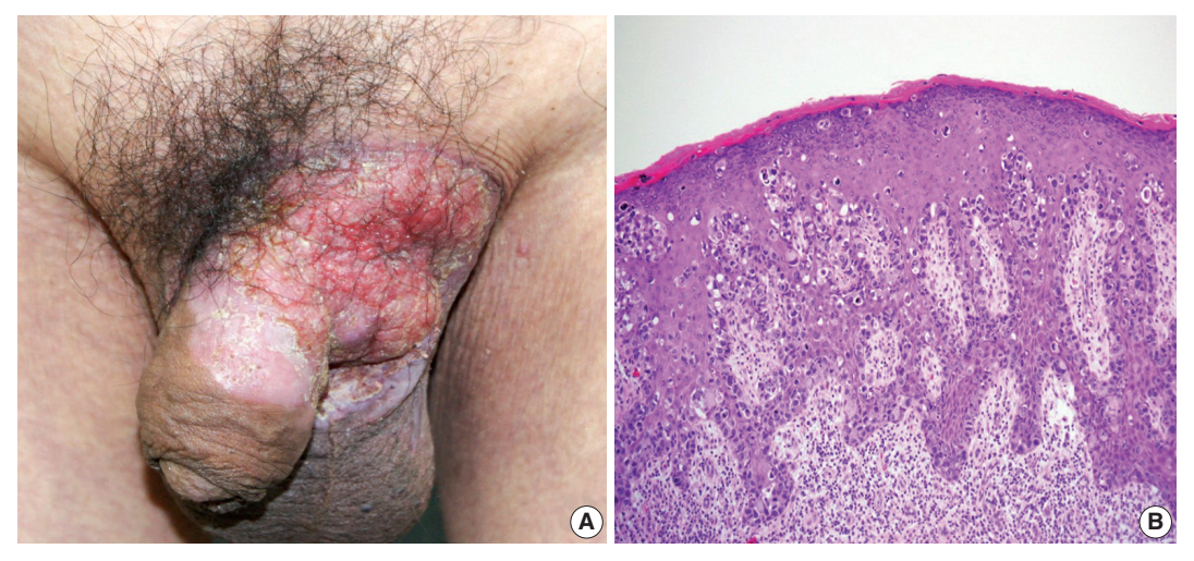
Fig. 1. (A) Erythematous plaque of the left groin with extension to the scrotum and penis. (B) Histology of preoperative skin biopsy revealing extensive involvement of the epidermis by large pagetoid cells with clear or eosinophilic cytoplasm.

the tumor, about 70%, and the rest consisted of poorly differentiated components. Tumor cells in both the mucinous pool and more cellular area revealed the same histological features of abundant eosinophilic cytoplasm and large vesicular nuclei with frequent mitoses up to 7/10 high power field (Fig. 2C, D). In