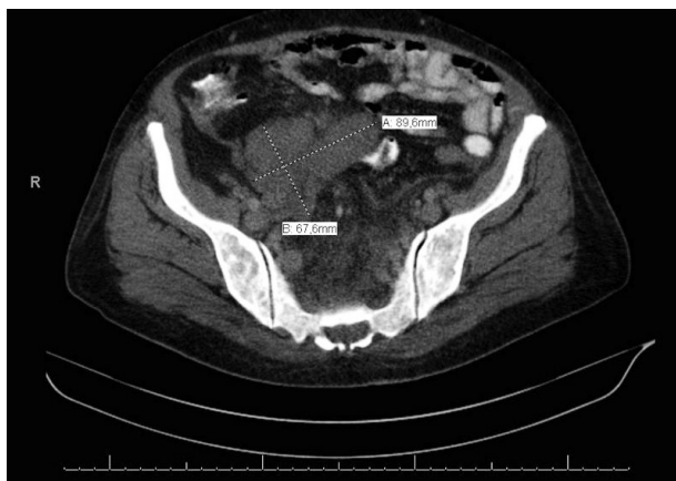
Fig. 1. A soft tissue lesion approximately 9.8×6 cm in size with a lobulated contour along the right iliac vascular structures of the right lower quadrant.

Microscopically, there were thick fibrotic bands, areas with more prominent collagen bands, mixed inflammatory cell infiltration including eosinophils, and occasional foci with individual or grouped enlarged cells with large cytoplasm and pleomorphic