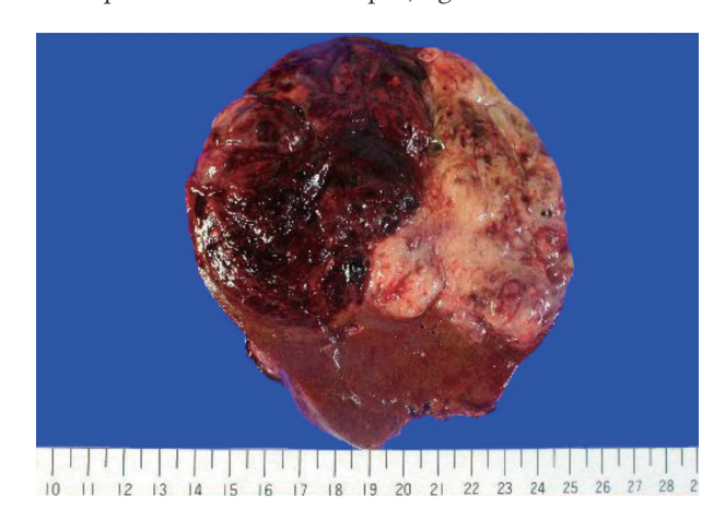
Fig. 2. The cut section shows a large variegated solid and firm mass, composed of a grey-to-yellow solid area and a dark red hemorrhagic area.

One month after the operation, the patient developed a recurrent mass on segments 6 and 7 on the remnant right hepatic lobe. The mass continued to grow, so MAID (mesna, doxorubicin, ifosfamide, and dacarbazine) chemotherapy was started. During the fifth cycle of chemotherapy, the patient developed neutropenic fever and died of sepsis, eight months after his ini-