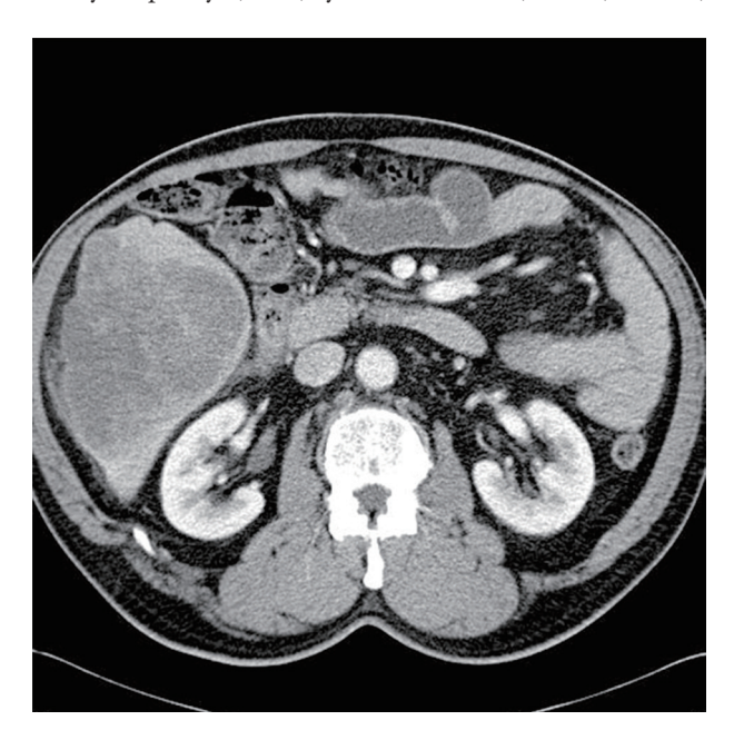
Fig. 1. A dynamic computed tomography study shows a 13-cm-sized hypoattenuating mass with lobulated contour in the right hepatic lobe, in segments 5 and 6.

Tumor cells had invaded into liver parenchyma, and several entrapped bile ducts were seen in the tumor mass periphery. Cytoplasm from the tumor cells showed diffusely positive expression of vimentin, alpha 1-antichymotrypsin and alpha 1-antitrypsin (Fig. 3D–F). CD68 and smooth muscle actin were positive only focally. Hepatocyte, AFP, cytokeratin (CK) 7, CK19, CD117,